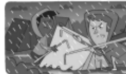
Mum and Dad got VERY

This has been the best day ever! We are camping in a real tent, right by the seaside!