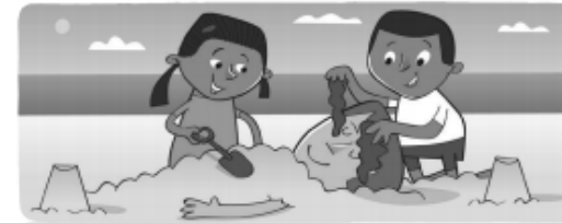
Dad was a bit cross when he woke up!

Now it's nearly bedtime. I'm looking forward to sleeping in my sleeping bag! I can hear the sea making a lovely swishing, swooshing sound.